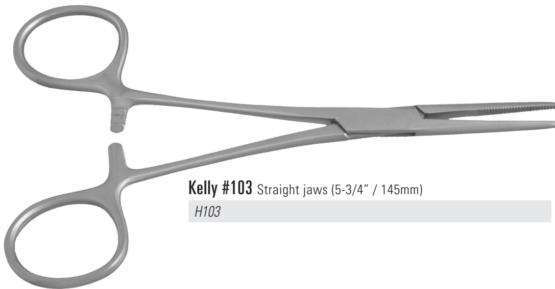
Kelly #103 Straight jaws (5-3/4" / 145mm)