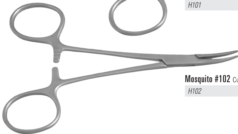
Mosquito #102 Curved jaws (4-3/4" / 120mm)