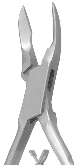
Niro Side Cutting #3

Single straight cutting surface blade. This rongeur has a slight "S-Curve" angulation for easier access. (5-1/2" / 140 mm).