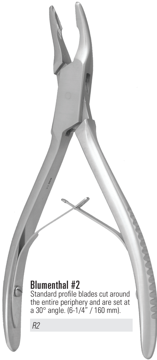
Blumenthal #2 Standard profile blades cut around the entire periphery and are set at a 30° angle. (6-1/4" / 160 mm).

Used to contour and remove alveolar bone during extraction procedures. Nordent Rongeurs are hardened and tempered to maintain their sharpness and have a satin finish to eliminate glare.